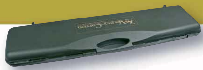
PVC case free with Sagittaire® Saint-Hubert Classic finish and Sagittaire® Polynox Classic finish