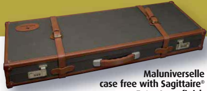
Maluniverselle case free with Sagittaire® Extra-Luxe finish