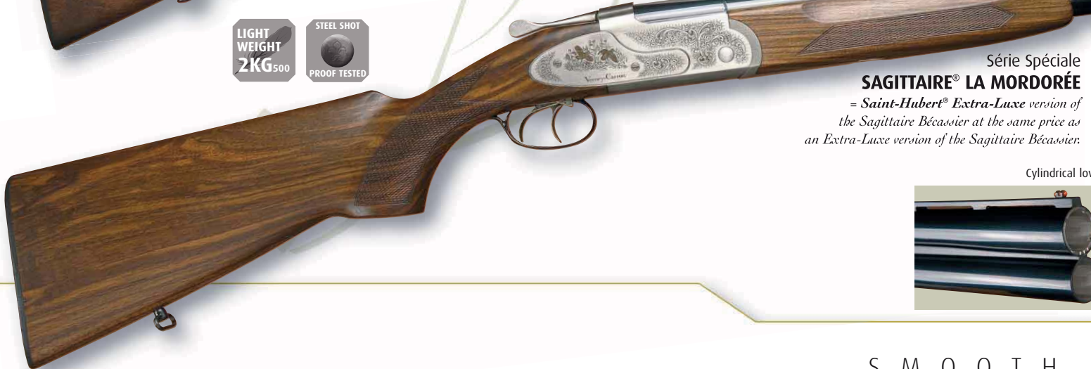
The weapon shown is a Sagittaire® Série Spéciale La Mordorée with extractor. Comes with a Maluniverselle case.