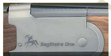
Classique "ONE" finish

SAGITTAIRE® SPÉCIAL PALOMBE 12 gauge Magnum. 76cm barrels. 11mm reamed ventilated rib. Pistol stock grip (or English with supplement).