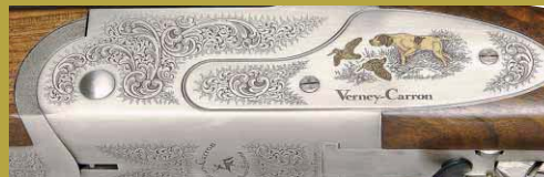
Sagittaire "woodcock" in its classic version